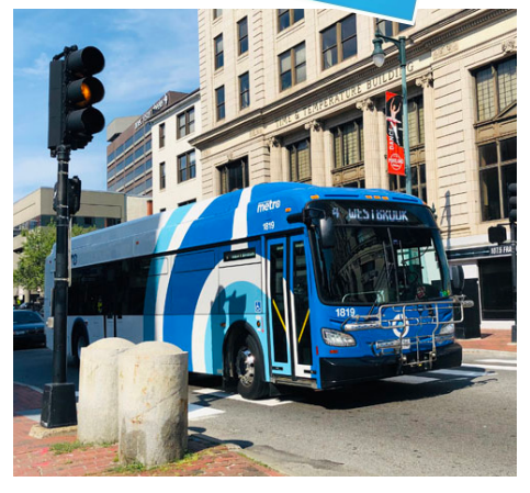
METRO DiriGO Passes ensure students never miss a class due to lack of transportation.