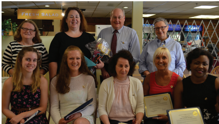
C.N.A. New England Rehab Class

& Residence and most recently First Atlantic Healthcare. The 12 week program consists of 180 hours of