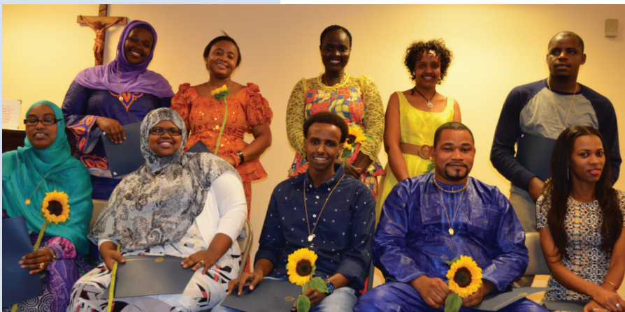
ELL C.N.A. Class