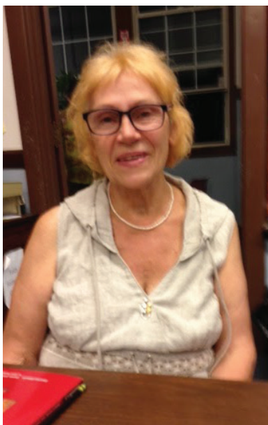
A PAE student with new glasses!