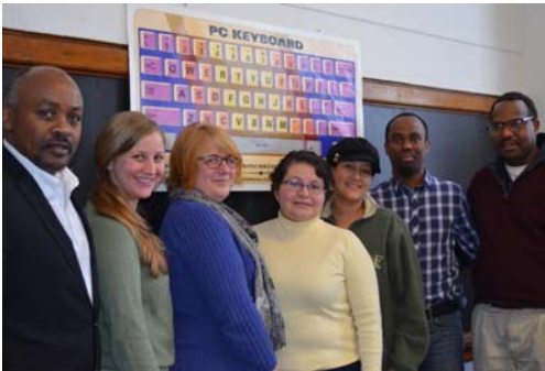
Students in PAE's new Basic Law Class.