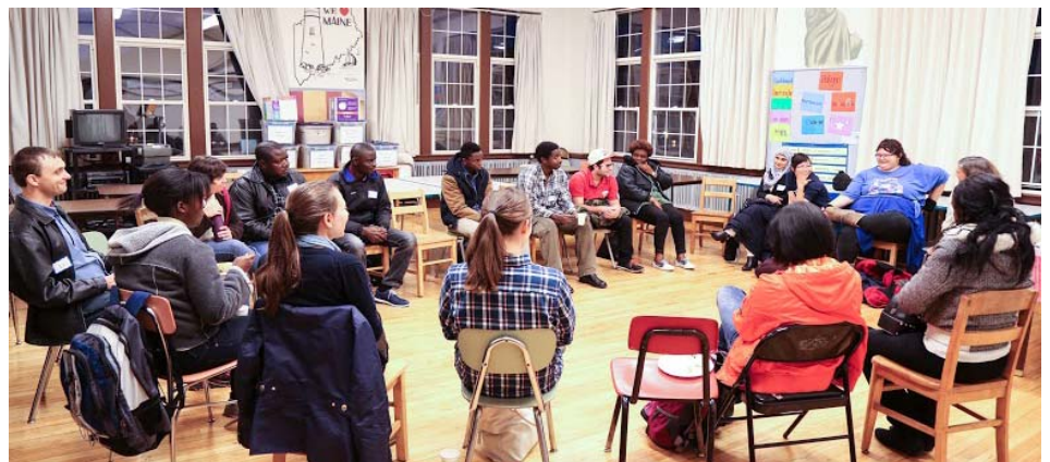
PAE Alums share their experience.

These alumni experts have earned the right to offer advice. One of the students achieved a 4.0 average in her first semester; another matched that GPA and is applying to transfer to colleges such as Smith and Wellesley after finishing her associate's degree. College may be tough, but College Transitions students are ready.